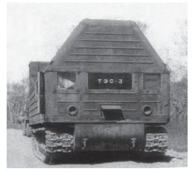
Figure 3. TES-3 on the move.