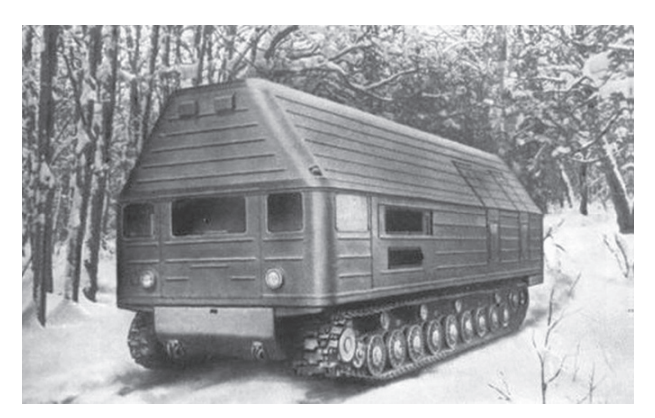
Figure 1. TES-3 power unit.

The TES-3 TNPP, with an electric power of 1500 kW, which became the first in the USSR (and in the world) practical experience in creating a transportable land-based nuclear power plant, consisted of four self-propelled plat-forms on elongated tracked chassis of a heavy tank with wagon-type bodies, functionally arranged in reactor and turbine units, auxiliary unit and control unit (Figs 1–3).