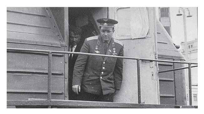
Figure 5. First cosmonaut Yu.A. Gagarin at TES-3 (May 31, 1966).

It is likely that in the near future a new historical monument based on the original TES-3 TNPP may appear in Obninsk. It can become one more element of the already existing system of symbols for the achievements of Obninsk scientists in the field of nuclear power, including the world's first nuclear power plant. The initiative to create an exposition of this unique object is being actively discussed by the scientific